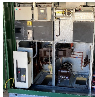
Installing new components