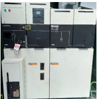
New cabinet installation