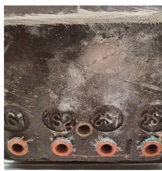
Evidence of discharge